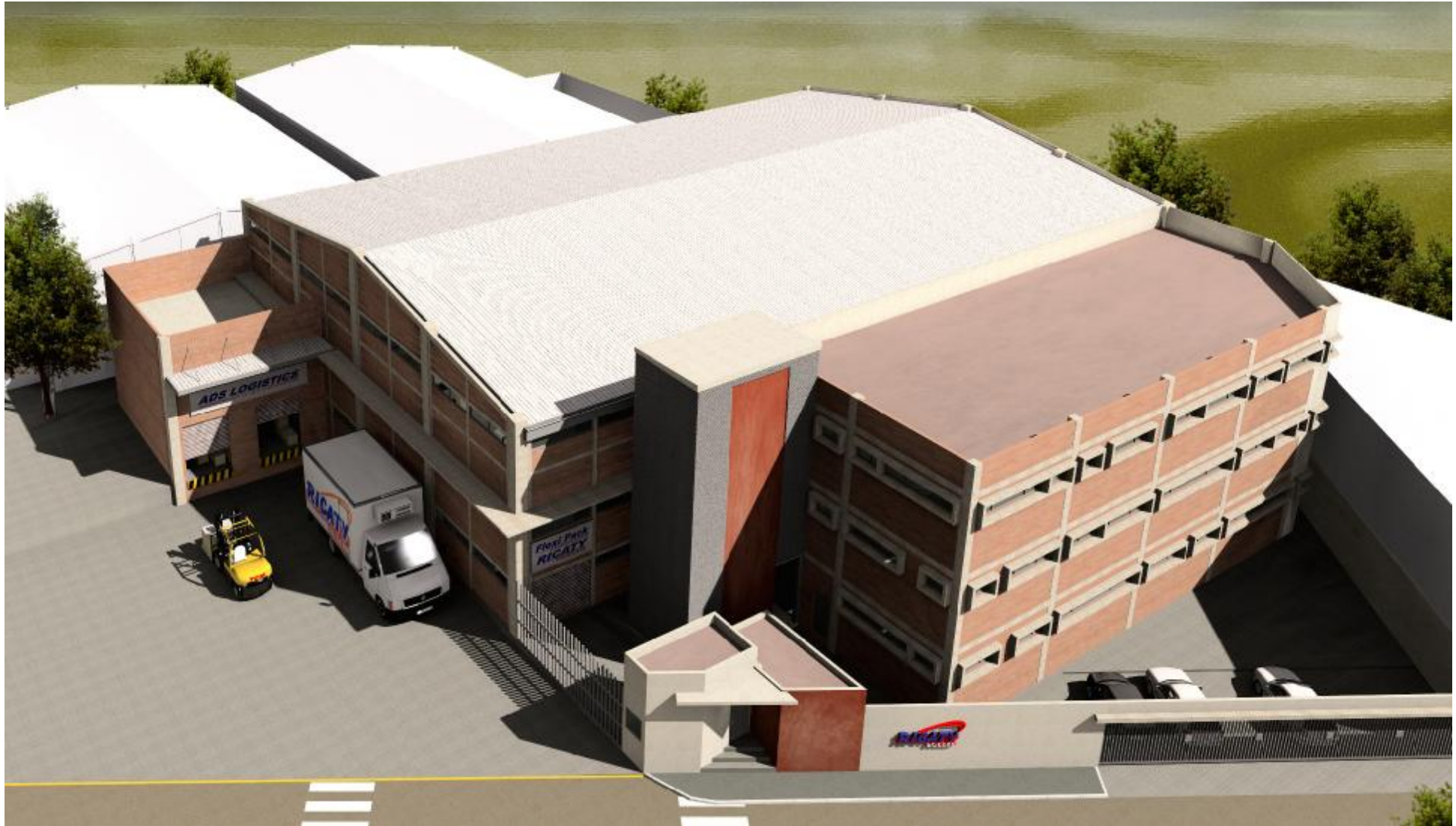
New Industrial Plant Complejo Industrial La Ciénega